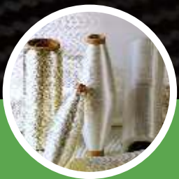
High Strength Fiberglass